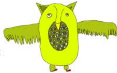
push button gently

Push Button Gently was born in 2006 as an experimental project based solely on improvisation, composition and recording.